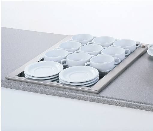
2 THSG - 02.1512